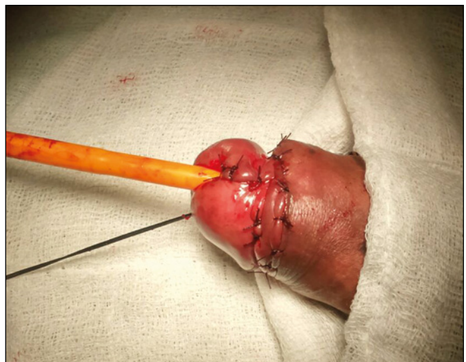
Figure 3. Glanuloplasty.