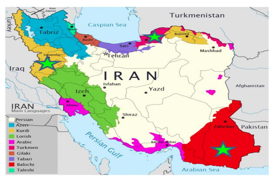
Fig. 1: Distribution of ethnic groups in Iran (https://en.wikipedia.org/wiki/Ethnicities_in_Iran)

Kurd in the west, Baloch in the south- east, and Turkmen in the north- east of Iran (Fig. 1).