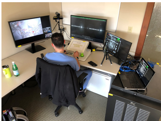
Figure 2 Offsite robotic control unit shown is the robotic control unit located in an office building approximately 5 miles away from the cardiovascular simulation laboratory. The monitor on the left displayed live video transmitted from the simulation laboratory and was intended to simulate fluoroscopy. In this image, the neurosurgeon is using the controls to telerobotically advance a wire from the carotid artery to the location of thrombus in the middle cerebral artery in the silicone model 5 miles away. MCA, middle cerebral artery; RRET, remote robotic endovascular thrombectomy

attempted procedures, the IC manually advanced an 8 Fr x 90 cm sheath (AXS Infinity LS, Stryker Neurovascular, Fremont, California, USA) from the right femoral artery to the left carotid artery and an 0.014 inch x 300 cm guidewire (Synchro 2 Support, Stryker Neurovascular, Fremont, California, USA) to the tip of the sheath. The IC loaded the guidewire into the robotic drive. All subsequent