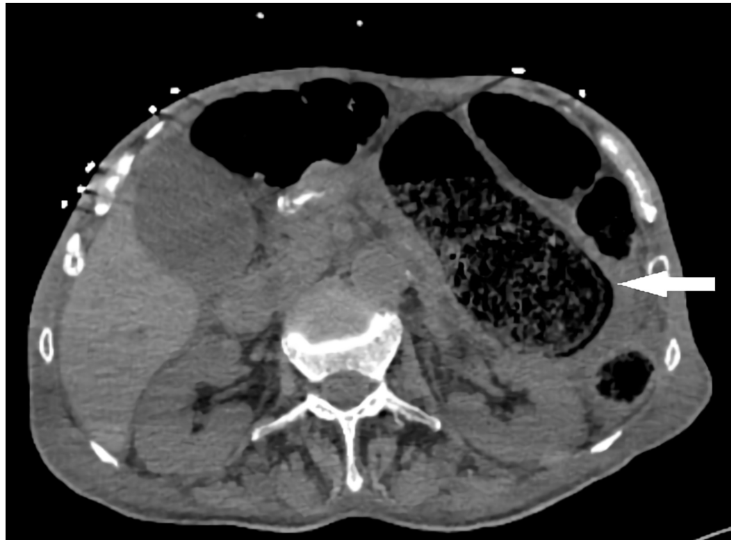
FIGURE 3: Dilated colon in computed tomography

On the second postoperative day, the patient was still unstable and intestinal content was apparent in the debrided scrotal region. Abdominopelvic CT scan revealed dilatation of descending and sigmoid colon and suspicious fistula tract from the lateral wall of the rectum to the perineum (Figure 3). After surgical consultation, an emergency laparotomy was planned.