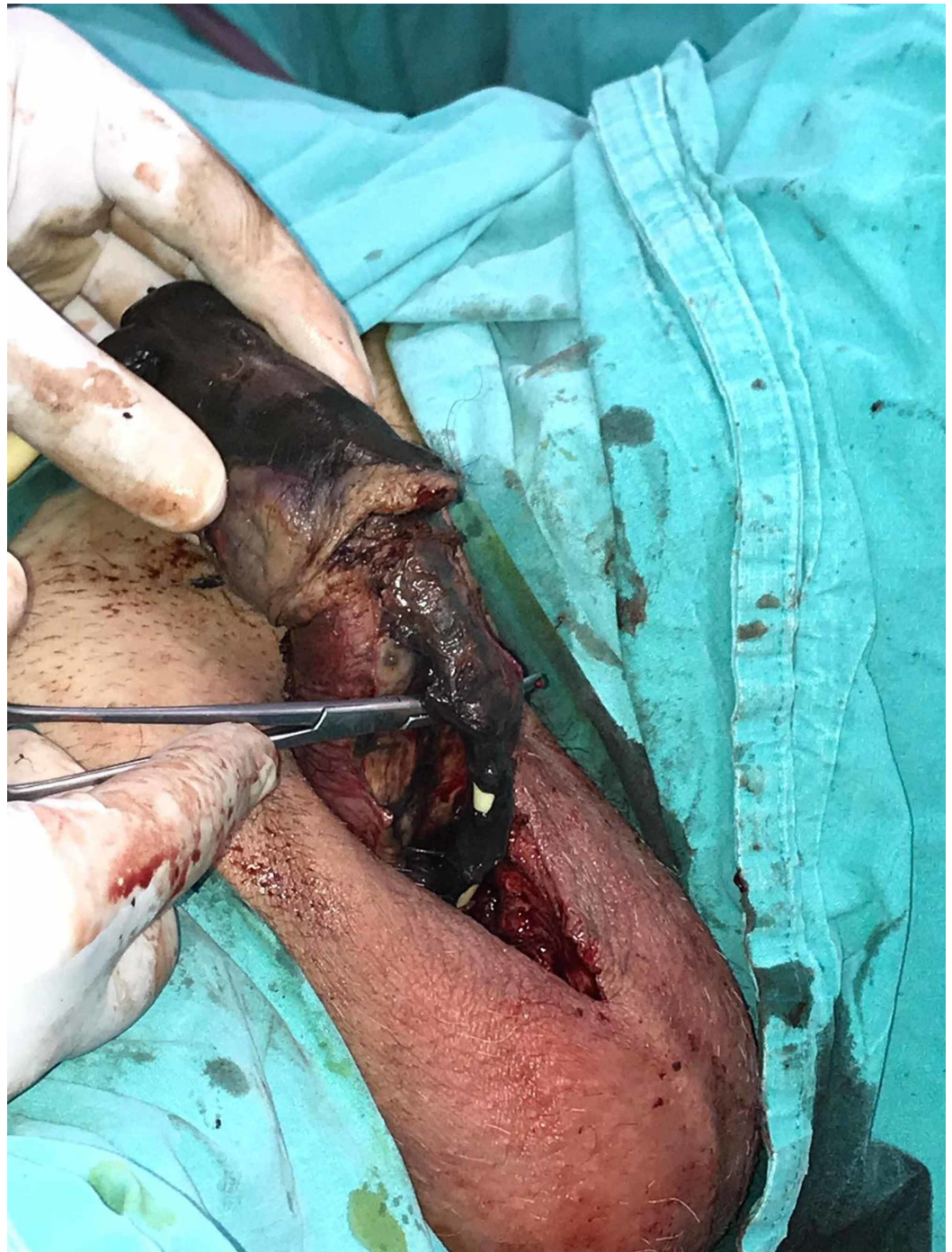
FIGURE 2: Necrosis extended to urethra

Rectoprostatic fascia was mostly necrotic. Rectum mucosa was viable. Scrotum, testicles, and spermatic cords were spared, but the left tunica vaginalis was partially involved. Penectomy, urethrectomy, and debridement of the necrotic tissues were performed. An indwelling cystostomy catheter was placed, and the urine was macroscopically clear without intestinal content, blood, or debris and so we ruled out a fistula. After the surgery, the patient was taken to the intensive care unit, and wide-spectrum antibiotics were started. Penile swab culture resulted in Klebsiella pneumoniae spp, and pathological examination revealed chronic granulation tissue with acute onset and severe necrosis.