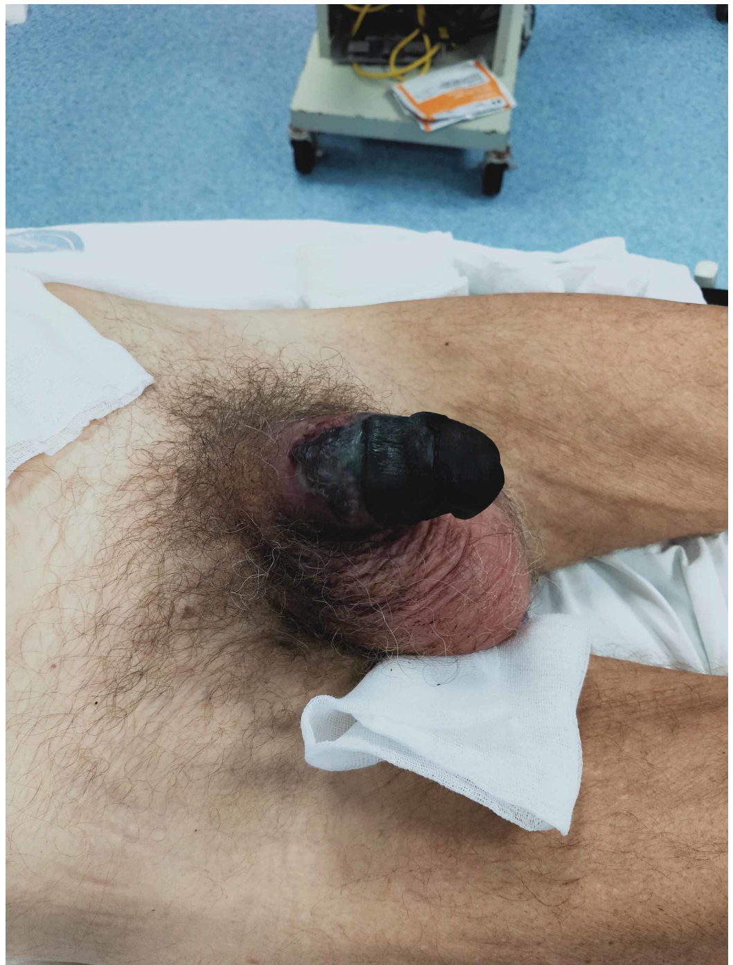
FIGURE 1: Isolated necrosis of the penis

Scrotum and perineum were preserved. The abdominal examination was normal. The anal canal was very hard and tender with palpation, and there was no bloody discharge and abscess formation.