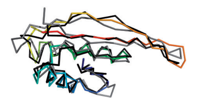
Fig. 2. Comparison of comparative (blue to red, N- to C-terminus), ROSETTA (grey) and I-TASSER (black) models of SpoVS.

Experimental data regarding SpoVS are apparently limited to two reports (Resnekov et al. , 1995; Perez et al. , 2006). In the first, mutation of the spoVS gene halted sporulation at Stage V and reduced expression of two \sigma^{K} -directed genes, cotA and gerE