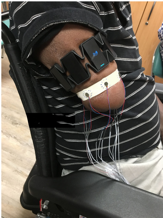
Fig. 3 Example of one patient with vibrors encapsulated in a plastic piece and attached to an elastic band by surgical file