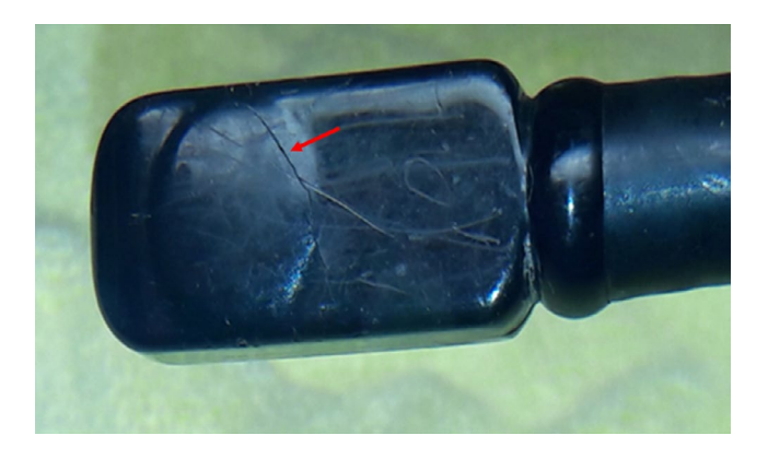
FIGURE 1 The tip of one of the transesophageal echocardiography probes in use during the study period. With magnification and specific lighting used in this photograph, numerous superficial scratches and a crack (arrow) in the plastic casing can be visualized. The damage was not obvious to the naked eye. The outbreak strains of Pseudomonas aeruginosa and Enterococcus faecalis were isolated from this crack, after the probe had been decontaminated and was ready for use [Colour figure can be viewed at wileyonlinelibrary.com]

In the year 2014, multiple patients in the intensive care unit (ICU) at Landspitali University Hospital developed pneumonia with an extensively beta-lactam resistant Klebsiella oxytoca. After a detailed investigation for possible sources of contamination in the ICU environment, the same strain of Koxytoca was isolated from a TEE probe which had been used in most cardiac operations at the hospital. Careful inspection under magnification revealed a small crack at the junction of the tip and the shaft of the TEE probe. The probe was subsequently replaced with another one that was previously unused but several years old. The use of a protective sheath to cover the probe while in patient use was encouraged, but not enforced. The outbreak strain of Koxytoca was not identified in any cardiac patient after changing the TEE probe. However, in the year 2017, three patients died of septic shock due to P aeruginosa shortly after cardiac surgery and two patients developed endocarditis due to Enterococcus faecalis between 1 and 12 weeks after cardiac surgery. One of those patients died. Inspection of the replacement TEE probe revealed minute damage, see Figure 1, and both pathogens were cultured from the probe despite decontamination.