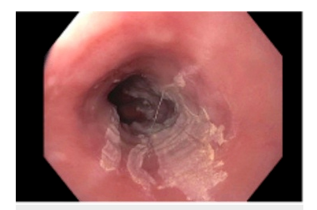
FIGURE 1: Endoscopy image showing esophageal mucosal sclerosis

A distal esophageal biopsy confirmed EDS (Figure 2).