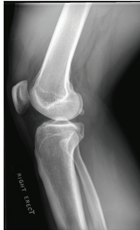
FIGURE 1: X-ray showing the fabella in a normal posterior location on the lateral X-ray.

2.2. Surgical Treatment. Preoperatively, we were able to palpate and mark the fabella with the patient (Figure 4). A tourniquet is used throughout the case to limit bleeding. We used a longitudinal incision directly over the fabella. The common peroneal nerve was identified, decompressed, and retracted laterally. The lateral gastrocnemius tendon was incised longitudinally directly over the fabella (Figure 5). The fabella itself