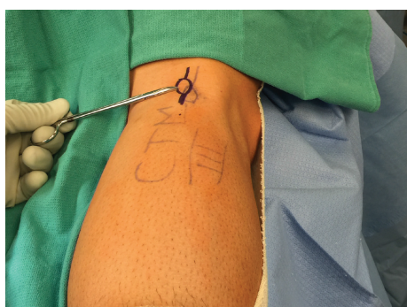
FIGURE 4: Preoperative marking of the fabella with the patient.