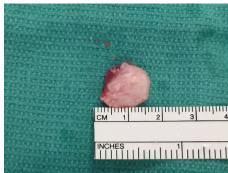
FIGURE 6: Fabella was removed as a single unit and measured 13 mm × 10 mm.