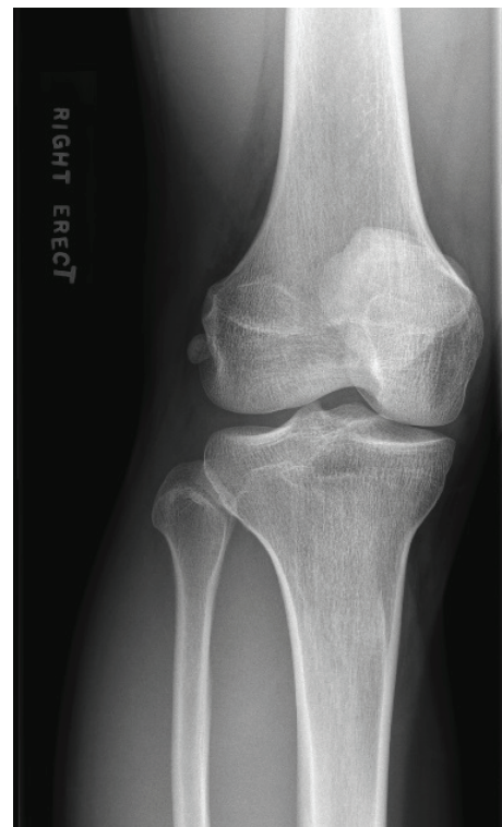
FIGURE 2: Fabella located lateral out from behind the lateral femur on the AP X-ray.