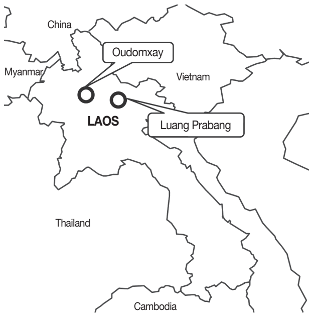
Fig. 1. The surveyed area in Lao PDR for human neurocysticercosis, Taenia solium , and porcine cysticercus infection.

For molecular typing of T. solium metacestodes collected from a pig in the same locality of Oudomxay Province (Fig. 1), PCR-amplified fragments of cox1 were directly sequenced. The prim-