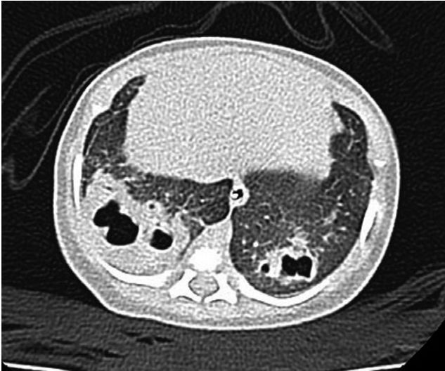
FIGURE 2 Pulmonary CT scan. Multiple thick-walled cystic images within bilateral basal condensation and in the right upper lobe and pneumatoceles in the context of necrotizing pneumonia

the first 72 hours of life, and late, developing after the second week of life. Most reported cases of neonatal pneumococcal sepsis have been early onset with symptoms appearing in the first 48 hours after delivery 2 indicating probable infection during the intrapartum or prenatal period, unlike the series reported by Hoffman et al 1 in which the mean age of presentation was 18.1 days of life. Low birthweight (below 2,000 g) and rupture of membranes lasting longer than 8 hours have been described as risk factors for neonatal pneumococcal infection. 2 Among the numerous S. pneumoniae serotypes described, perinatal invasive disease has been mainly reported in types 1 to 12, 14, 17 to 19, 23, 27, 28, 31 and 39. However, according to published data, 1 neonatal mortality seems not to be related to serotype or antibiotic sensitivity. Other authors 3 described a stronger association between serotypes 3 and 19A and necrotizing pneumonia. In our case, the serotype was 12F, an emerging serotype, not included in the 13-valent conjugate pneumococcal vaccine.