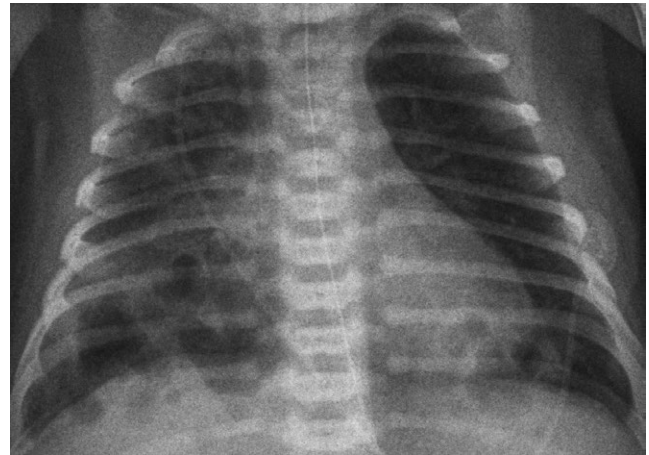
FIGURE 1 Thorax radiography. Bilateral basal condensation. Bilateral cystic thick-walled cystic images within the condensation

alveolar infiltrate. Respiratory support was initiated with high-flow oxygen therapy and volume expansion, and empirical antibiotic therapy was started with ampicillin (150 mg/kg/d) and cefotaxime (200 mg/kg/d). Afterward, the patient showed clinical deterioration, with fever of up to 39°C and involvement of general status, requiring admission to the Neonatal Intensive Care Unit (NICU), respiratory support (high-flow oxygen therapy) and vasoactive support (dopamine). On the third day of admission, a positive blood culture result for cefotaxime-sensitive, ampicillin-sensitive and gentamicin-resistant S. pneumoniae (serotype 12F) was received. Therefore, according to the minimum inhibitory concentrations received (MIC 0.015 for cefotaxime and 0.023 for ampicillin), the spectrum of the two antibiotics (higher for the cefotaxime) and the favorable clinical evolution presented by the patient (72 hours of antibiotic therapy started), the