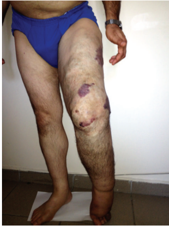
FIGURE 1: The appearance of the lower extremities of the patient showing shortness and thickness of the left leg with variceal enlargement of the veins and hemangiomas.

Key Message. The diagnosis of Klippel Trenaunay Weber syndrome may be delayed into adulthood and FSGS may coexist with this syndrome.