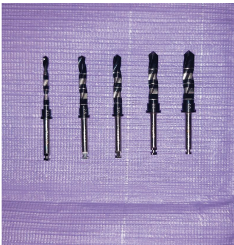
FIGURE 2: Gradual implant drills for the final implant bed for 4.25Ø mm implant; the gradual drill designs contain twisted flutes and only the pilot drill have a working tip (GMI, Frontier).

2.3. Statistical Analysis. In this study, the level of significance ( p value) and power of the study were set at 0.05% and 90%, respectively. Student's t -test for independent samples was used with the 95% confidence intervals (CIs) for the means of \Delta T between groups A and B.