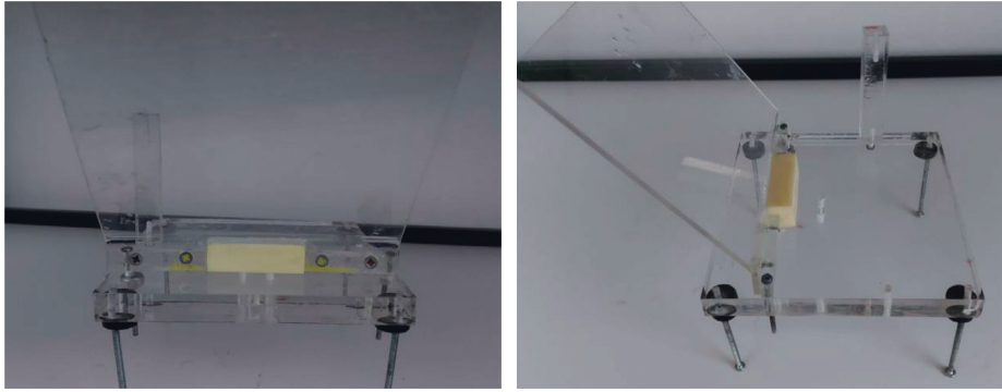
FIGURE 4: The design of the bracket. The special bracket was designed for holding the samples during the osteotomies, and a gingival protector was used also to isolate the surface where the temperature was measured in order to prevent the irrigation from interfering with the infrared camera readings and giving rise to measurement errors.