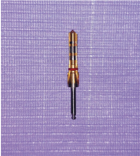
FIGURE 1: Single drill for preparing the final implant bed for 4.25Ø mm implant; the single drill design contains 3 straight flutes with wide channels between them (FGM, Arcsys).