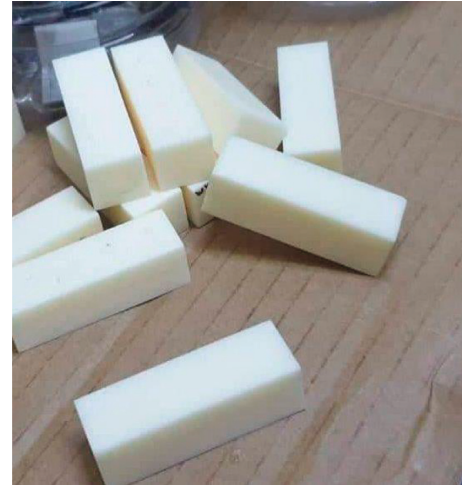
FIGURE 3: D1 artificial bone blocks made from solid rigid polyurethane foam (SRPF) (#1522-23; Sawbones, Malmö, Sweden).

The sample consisted of 24 implant site preparations, which were divided into two main groups (A and B), two equals, according to the method of preparing the implant site (using the single drilling protocol or the conventional drilling protocol), and the sample was distributed according to the method of preparing the implant site as given in Table 1.