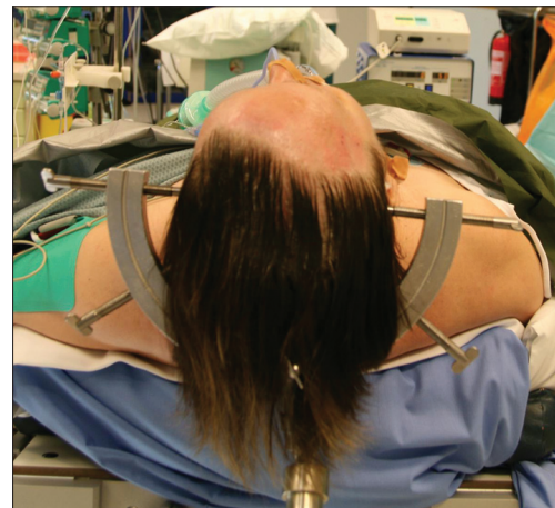
Figure 2: The slight rotation of the head in a right lateral supraorbital approach