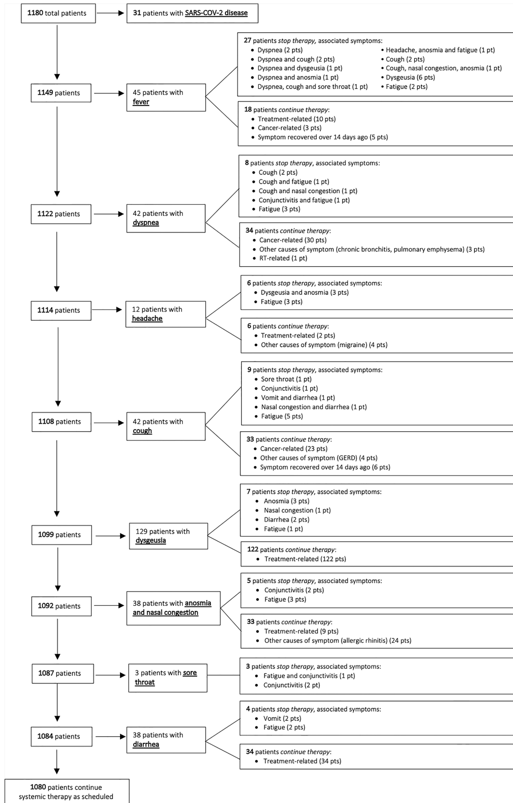
FIGURE 2 | Flowchart of triage questions selecting patients eligible for treatment.