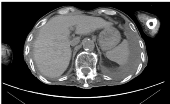
Fig. 3 Follow-up computed tomography on hospital day 14 showed resolution of hepatic portal venous gas and air within the stomach wall

It appears that HPVG without any signs of bowel ischemia or emphysematous gastritis can resolve without any treatment in patients who are supported by chronic PEG feeding. HPVG was recognized to be fatal in the 1980s, yet recent increases in cases have demonstrated that non-symptomatic HPVG is not necessarily fatal [13]. In the present case, there were no acute abdominal symptoms on physical examination, and a blood test showed pH 7.445, base excess 1.9 mmol/L, and lactate dehydrogenase 224 IU/l. In addition, CT did not indicate