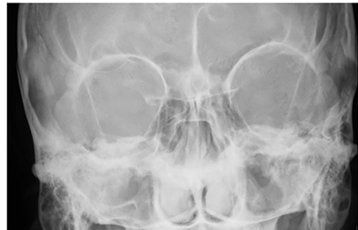
Fig. 6. Orbit X-Ray after extraction.

Oral azytromicine 500 mg a day for 6 days was prescribed and local skin tobramicine ointment was applied.