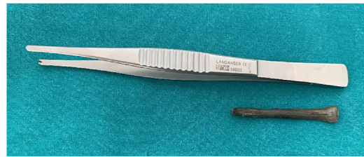
Fig. 5. The nail after extraction.