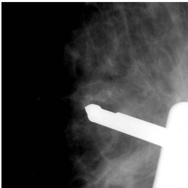
Figure 1 The suspicious lesion and the vacuum-assisted breast biopsy probe underneath the skin.