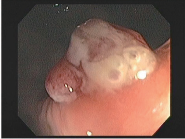
Figure 1. Colonoscopic view of incompletely excised 8mm distal rectal polyp.

Traumatic neuromas are non-neoplastic proliferative lesions that may manifest at the proximal end of a nerve that is severed, partially transected or injured via either traumatic or surgical means [1, 2]. These fibroinflammatory lesions arise in two varieties according to the type of insult sustained by the peripheral nerve. Terminal neuromas arise at the proximal end of a partially or fully transected peripheral nerve, while spindle