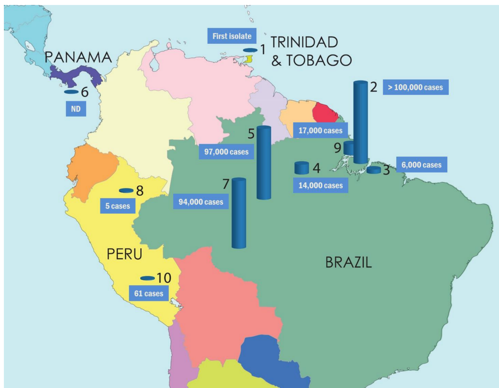
Figure 3. The spread of OROV in Central and South America from 1955 to 2016 (Bar symbols represent the affected populations in different geographical locations, and the estimated or confirmed number of infected individuals in several outbreaks). 1—Trinidad and Tobago, 1955 first isolated (one case); 2—Belém, Pará, Brazil, 1961 first epidemic (11,000 cases), 1979–1980 epidemic (>100,000 cases); 3—Braganca, Pará, Brazil, 1967 epidemic (6000 cases); 4—Santarém, Pará, Brazil, 1975 epidemic (14,000 cases); 5—Manaus, Amazonas, Brazil, 1980–1981 epidemic (97,000 cases); 6—Panama, 1989 first epidemic (N.D: no data); 7—Ariquemes and Ouro Preto do Oeste, Rondônia, Brazil, 1991 epidemic (94,000 cases); 8—Iquitos, Peru, 1992 first epidemic (five confirmed cases); 9—Magalhães Barata & Maracanã, Pará, Brazil, 2006 epidemic (17,000 cases); 10—Cusco, Peru, 2016 last reported epidemic (61 cases).

The emergence and re-emergence of OROV fever in Central and South America have resulted in more than 30 epidemics in Brazil, Peru, Panama, and Trinidad and Tobago, the majority being reported in Brazil, with disease prevalence to be 20% in both urban and rural human populations of the affected regions (Figure 3) [46–48]. OROV is the second most frequent arbovirus in Brazil after dengue virus and among 200 different arboviruses isolated in this country [49,50], with considerable social and economic impact. It is estimated that over half a million of people have been infected by OROV in over 60 years, but it is likely the actual number of cases to be higher since many of them may go undiagnosed or misdiagnosed due to similar clinical manifestations with other febrile diseases caused by other arboviruses (e.g., dengue, West Nile, yellow fever, Zika, chikungunya, Guama, Mayaro) co-circulating in the endemic regions [5,48,51,52].