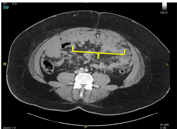
Fig. 3. Arrows showing extensive infiltrate and nodules within the peritoneum and omentum in case 2.

and antrum, an exophytic mass at the gastric fundus, and extensive nodularity on the omentum. An esophagogastroduodenoscopy (EGD) showed an ulcerative tumor at the distal stomach. Subsequent biopsy undertaken showed high-grade malignant B-cell NHL – DLBCL or Burkitt lymphoma. Immunohistochemistry staining showed: pankeratin-, CD20+, CD10+, MUM1+, BCL6+, BCL2-, CD3+, CD5+, EBER ISH-, and Ki67 near 100%. Laparoscopy with biopsy conducted verified c-MYC translocation confirming Burkitt lymphoma. Other procedures included a CT guided bone marrow biopsy and X-Ray (XR) guided spinal tap that were negative for malignancy, and