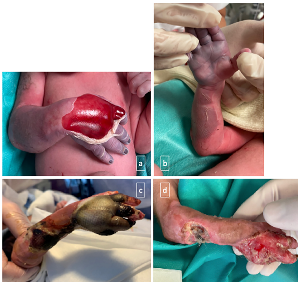
Fig. 1. Clinical course of ischaemia: at birth (a, b), at D21 of life (c), and at D29 of life, i.e. five days after amputation (d).