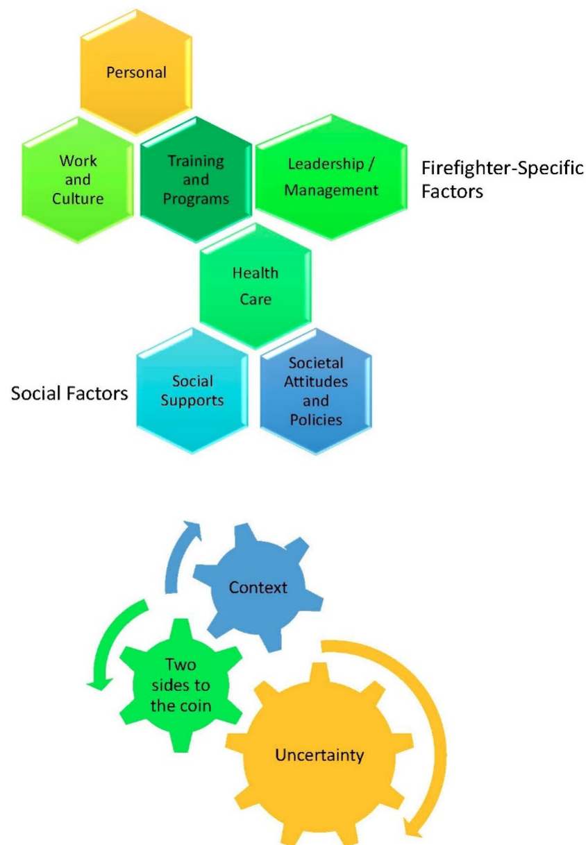
Figure 1. Firefighter Mental Health Themes.

The results are organized to address the major questions and themes that emerged on the impacts of mental health (personal, family, and work) and associated barriers and facilitators (personal, fire work and culture, fire service training and programs, leadership and management, health care, social supports, and societal attitudes and policies). Although firefighters were uncertain about identifying research priorities, their responses reflected these themes and the needed types of research. The overarching latent themes that arose across all lines of inquiry were the importance of contextual differences, that issues had “two sides to the coin”, and that there is a great deal of uncertainty in mental health (Figure 1). This was reflected in differences in needs, experiences, stressful incidents, response to incidents, access to help, and mental health outcomes.