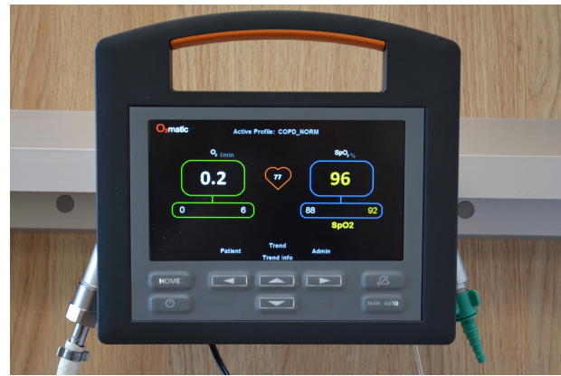
Figure 1 The O2matic® device.

The O2matic oxygen controller is a closed-loop system that, based on continuous monitoring of pulse and \text{SpO}_2 by a standard wired pulse oximeter, adjusts oxygen flow to