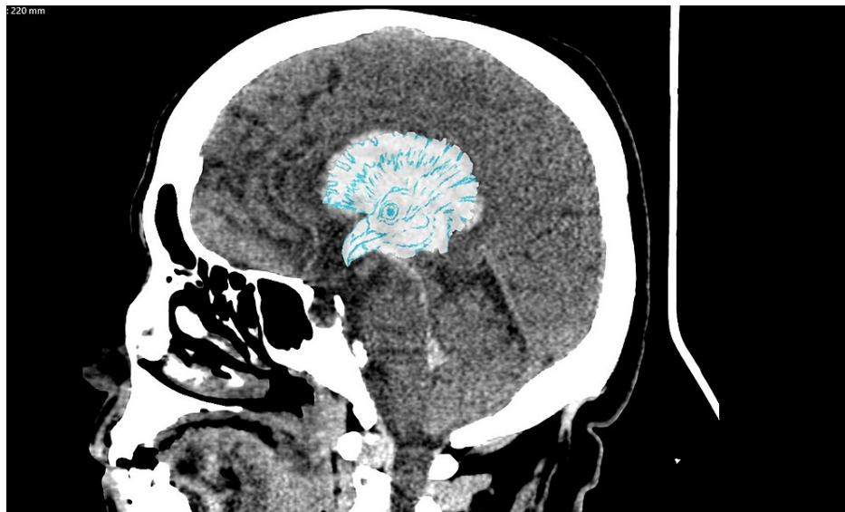
FIGURE 3: Crax rubra sign.

A photograph by Zinn, N. (2020). Great Curassow ( Crax rubra ) 2048×1638 [17] with permission.