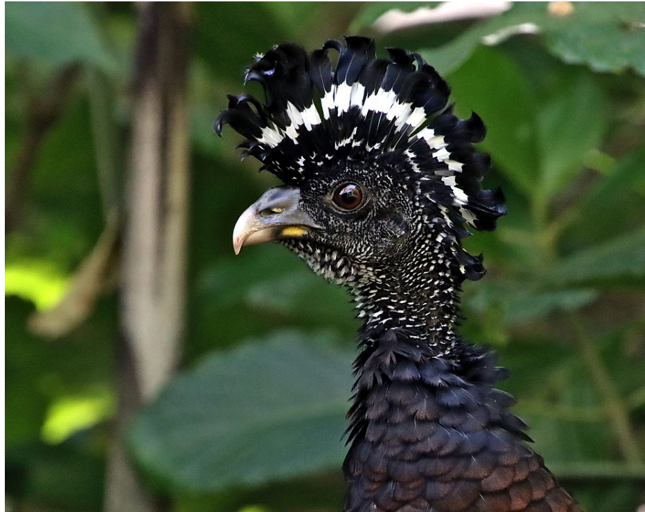
FIGURE 2: Crax rubra.

A photograph by Zinn, N. (2020). Great Curassow ( Crax rubra ) 2048×1638 [17] with permission.