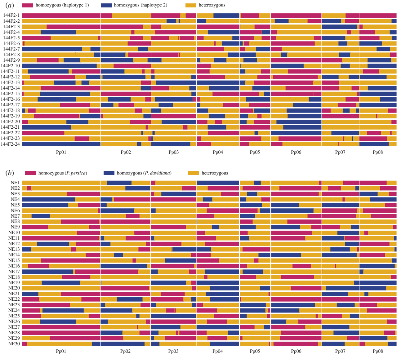
Figure 2. Graphical representation of CO recombinants. (a) Intraspecific ( P. persica ) F 2 samples, the homozygous genotype was choosing by random for each chromosome; (b) interspecific F 2 samples, the red haplotypes were derived from P. persica while the blue haplotypes were derived from its wild ancestor P. davidiana .

material, table S5) with a combined span of approximately 19-Mbp and 14 CO coldspots (10 000 randomizations, p < 0.05 ; electronic supplementary material, table S6), with a combined length of 53.8 Mbp. In other words, approximately 29% of CO events are clustered within approximately 8.6% of the entire genome (electronic supplementary material, table S5), and approximately 23.9% of the genome is devoid of the CO events (electronic supplementary material, table S6). The average recombination rate in hotspot regions ( 8.04 \text{ cM Mb}^{-1} ) is about 16.8-fold higher than that in the cold-spot regions ( 0.48 \text{ cM Mb}^{-1} ; t -test, p = 1.58 \times 10^{-17} ). Gene ontology analysis reveals a slight enrichment in serine-type endopeptidase activity under molecular function near hotspots (electronic supplementary material, figure S4), while coldspots are enriched for cysteine-type peptidase activity or other various binding activities, and most genes were related to the macromolecule metabolic process (electronic supplementary material, figure S5).