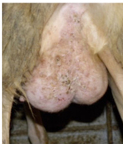
Figure 1. Clinical presentation of pustular dermatitis.

S. aureus represents one of the most important causative agents of foodborne illness consequent to cheese consumption, especially for those made from raw milk in