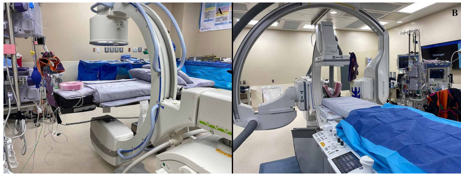
FIGURE 3: Figure 3A features a standard operating room with C-arm in place, and Figure 3B demonstrates a hybrid operating room with biplane fluoroscopy in place. Not pictured are frames that can be affixed to the operating room bed, the entire sterile set-up, and the process of moving the C-arm in and out of the surgical field while maintaining sterility.

The technique described in this report is most advantageous for cases involving the upper or mid thoracic spine due to decreased penetration and thus lower image quality of the C-arm for these regions. However, there are several limitations of this technique to note. The hybrid OR is suboptimal compared to a standard OR for open spine cases or extreme lateral interbody fusions. Additionally, if maintenance or correction of lumbar lordosis is required, a standard OR is superior. Otherwise, a hybrid OR with biplane fluoroscopy can be used for most cases requiring percutaneous instrumentation of the thoracic or lumbar spine without the aforementioned limitations. It is important to note that this is a report of a single case. Further research with larger sample sizes is necessary to evaluate and compare patient outcomes following percutaneous instrumentation in a hybrid OR with biplane fluoroscopy or in a standard OR with C-arm.