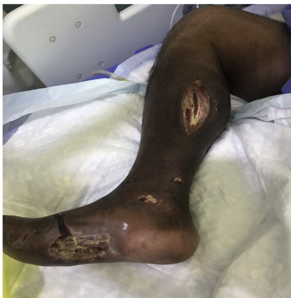
Fig. 2. Right leg Ischemic and evidence of Gangrene.

tions during his Hospital stay. He was moved to surgical ward on 06/08/2018. The right foot wound has improved with healthy granulation tissue on the right leg wound, however, right foot still has some slough along granulation tissue. Therefore, the patient was vitally stable, ready for discharge on 02/09/2018 and to continue daily dressings as an out-patient. The next day 03/09/2018 patient readmitted with urosepsis to medical ward. The Surgical team of the hospital followed up as consultation for the progress of the wound and dressings continued. The calf wound was very clean however, the foot wound has minimal slough that needed daily dressings and occasionally bed side debridement. On 03/10/2018 he intubated again due to overwhelming sepsis and set on inotropic support and transferred to medical ICU. Due to the vasopressor effects the whole right leg to the level of the knee became ischemic and black with evidence of wet gangrene (Fig. 2).