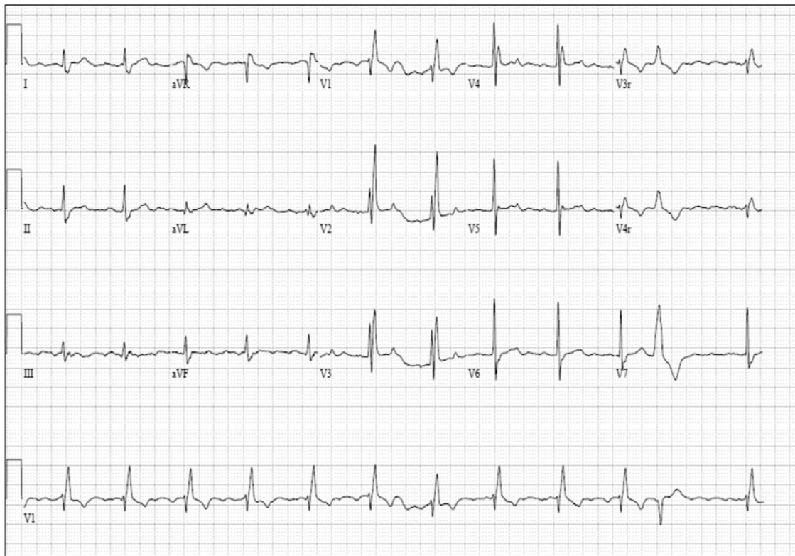
Figure 3 Postprocedure 12-lead electrocardiogram shows sinus rhythm with right bundle branch block. A single premature ventricular complex (PVC) is seen. Atrial flutter can also be appreciated, following the PVC.