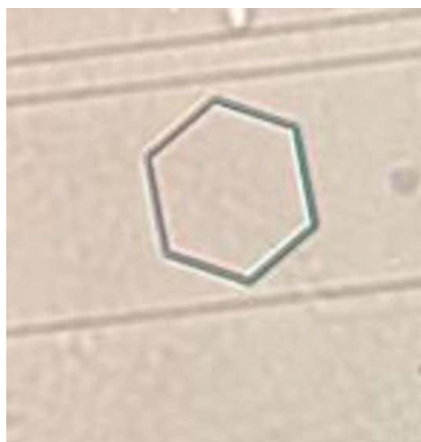
Fig. 1 - cystine crystal in urine. (40×)