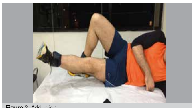
Figure 2. Adduction.