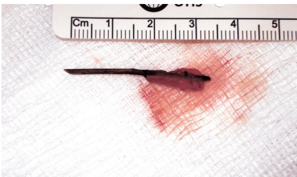
Figure 2 The toothpick after laparoscopic extraction.

Foreign body ingestion is a common event which may happen accidentally or intentionally [1]. Many such ingested foreign bodies pass through the gastrointestinal tract uneventfully [5]. However, in the case of sharp objects such as toothpicks, serious complications can be unavoidable. Ingested toothpicks tend to stick in places where there is natural narrowing, sharp angulations, or congenital gastrointestinal malformation [6]. Li et al. in his systemic review of 57 cases found that the duodenum and sigmoid colon are the commonest sites for perforation. Patients diagnosed with perforation of the gastrointestinal tract due to toothpick ingestion are usually men (88%) who present with abdominal pain (70%) or gastrointestinal bleeding (7%). Only 12% of patients had any recollection of swallowing a toothpick. In patients who remembered the event, the onset of symptoms ranged from less than a day to 15 years. The duration of symptoms before diagnosis ranged from one day to nine months [2]. Toothpick ingestion may cause severe, sometimes fatal, internal injuries due to gastrointestinal