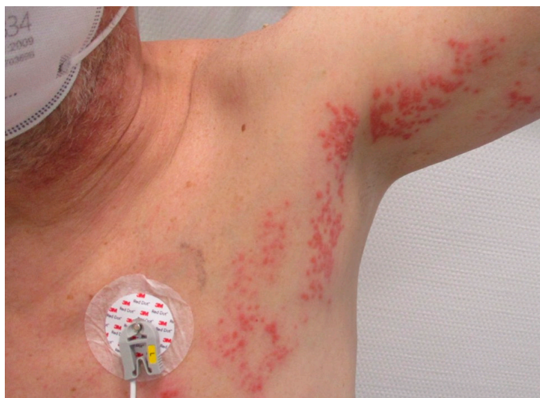
Figure 1. Herpes zoster infection, pathognomonic clinical appearance.