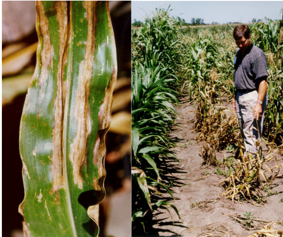
Figure 1: Left-hand panel: symptoms on maize leaves that show traces of insect bites. Right-hand panel: susceptible maize lines showing heavy dwarfing compared to neighbouring less susceptible lines (both pictures taken in Iowa, USA, and kindly provided by David Caffier, INRA)

The bacterium is seed-borne, seed playing an important role for long-distance dissemination (Block et al., 1998). However, no information was found on how P. s. subsp. stewartii colonises seedlings from infected seeds. Seed-to-seedling transmission has been observed even though the transmission rate is very low (e.g. less than 0.06% for seed with less than 10% infected kernels) (Block et al., 1998).