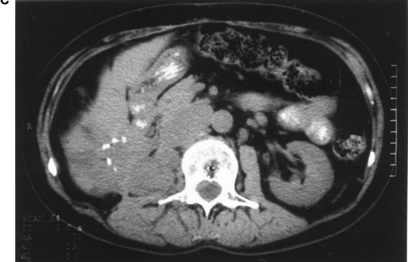
Figure 1 Liver CT scans of a 58-year-old patient with a history of advanced renal cell carcinoma, post-surgical of tumour nephrectomy and partial liver resection who (A) subsequently developed extensive metastatic lesions in his liver. (B) Partial remission of metastatic liver disease after the first 8-week treatment cycle with p.o. capecitabine, s.c. INF- \alpha ; s.c. IL-2 and p.o. 13-cisRA. (C) Further tumour regression upon completion of the third consecutive treatment cycle.

therapy trial of recombinant human interleukin-2 and interferon alfa-2 in progressive metastatic renal cell carcinoma. J Clin Oncol 13 : 497–501