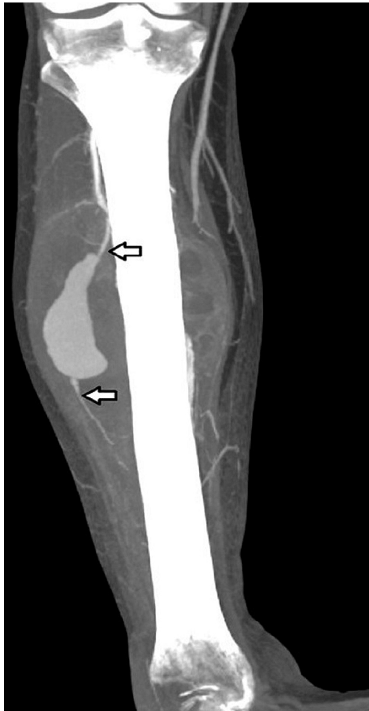
FIGURE 2: Pseudoaneurysm

CT angiography of the right lower extremity confirming the pseudoaneurysm arising from the proximal aspect of the anterior tibial artery (arrows).