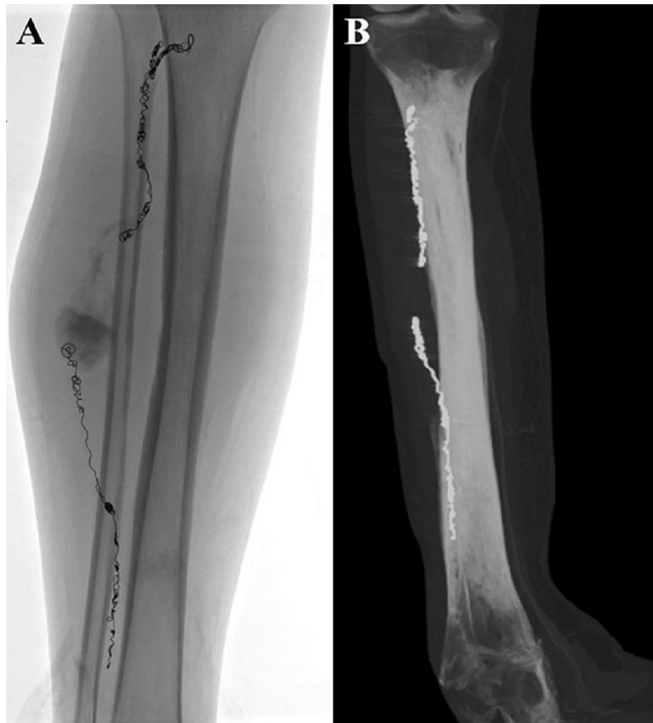
FIGURE 3: Post embolization and at eight months follow-up

aneurysms in the right lower extremity attributed to the patient's EDS. No coils were placed in the pseudoaneurysm to avoid a large coil mass which causes late complications. Stagnant contrast was noted in PSA at the end of the procedure (Figure 3A). Surveillance computed tomography angiography at eight months demonstrated no residual filling of the pseudoaneurysm (Figure 3B).