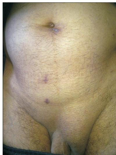
Fig. 2. The image of a pseudorecurrence following laparoscopic total extraperitoneal for left scrotal hernia in a patient of control group.

Although the first report on using fibrin sealants for mesh fixation had a primary aim of reducing the recurrence rate [18], minimizing bleeding complications and postoperative chronic groin pain were other primary endpoints in subsequent studies [11,19-22]. However, postoperative seroma, in other words pseudorecurrence, is also an important and common complication of laparoscopic large hernia repair (Fig. 2). It is well known that fluid collection at the surgical site is a normal process of wound healing depending on inflammatory response directly related to various surgical applications such as cutting, catheterization, suturation, etc. The extent of dissecting area, being old or recurrent hernia, and use of prosthetic patch also contribute to the development of fluid collection. The effectiveness of an adhesive material for mesh fixation in inguinal hernia repair upon seroma formation has not been clearly demonstrated. Although some authors