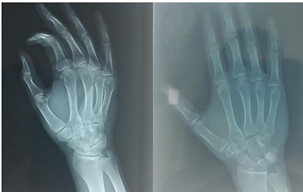
Fig. 4. Hand X-rays after K wires removal.

hand injury. In our case there was no associated or vital trauma, the diagnosis was easier and treatment was urgent by closed reduction. The choice of treatment depends on the severity and stability of the CMC joints, and the time of the hand injury