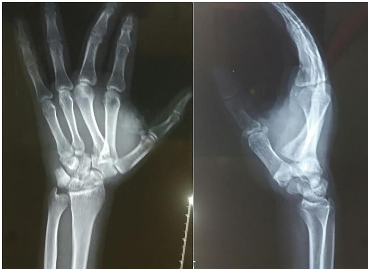
Fig. 1. X-rays showing divergent dislocation of 2nd and 3rd CMC joint (dorsal displacement of 2nd and palmar displacement of 3rd CMC joint).

metacarpal base in volar direction, without any associated fracture (Fig. 1). CT scan showed well directions of the two dislocations and eliminate any additional lesion (Fig. 2). Under general anesthesia and supine position, surgeon reduced the dislocation by applying longitudinal traction to the index and middle fingers with pressure over the base of the dislocated metacarpals while a second surgeon applied a counter traction to the forearm. A fluoroscopic check indicated appropriate metacarpals alignment and wrist joints reduction, then dislocations were stabilized with three percutaneous 1.5 mm K-wires; two longitudinally across the carpometacarpal joints and one transversal intermetacarpal. Postoperative X-rays revealed excellent reduction and alignment of the CMC joints (Fig. 3).