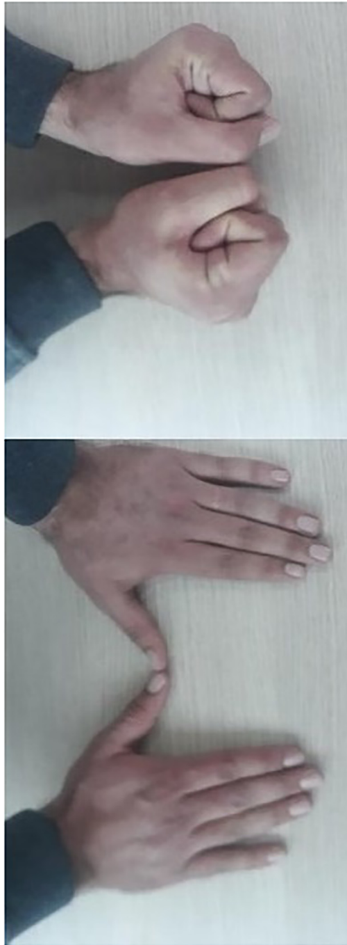
Fig. 5. Clinical images showing normal anatomy and hand function.