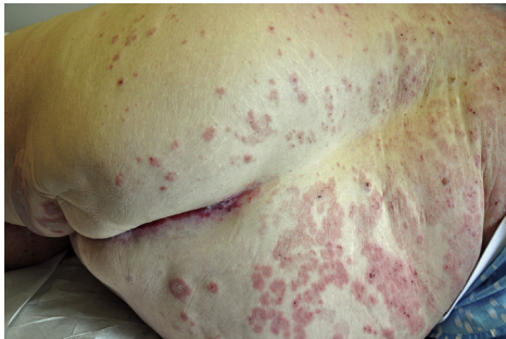
Fig 2. Generalized pruritic, urticarial and bullous lesions developed immediately after starting etanercept.

treated successfully with dapsone, with new bulla formation ceasing 3 weeks into dapsone treatment at 100 mg/d. The lesions and pruritus further improved at a dapsone dose of 150 mg/d.