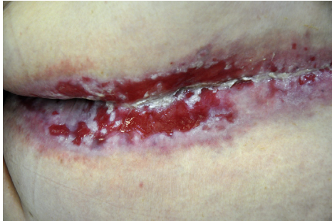
Fig 1. Large, confluent erosions in the perianal/perineal area and midgluteal fold.