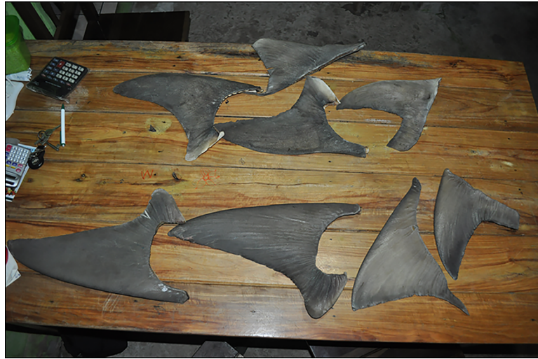
Fig 3. Dried shark fins over 35 cm length.

https://doi.org/10.1371/journal.pone.0193969.g003