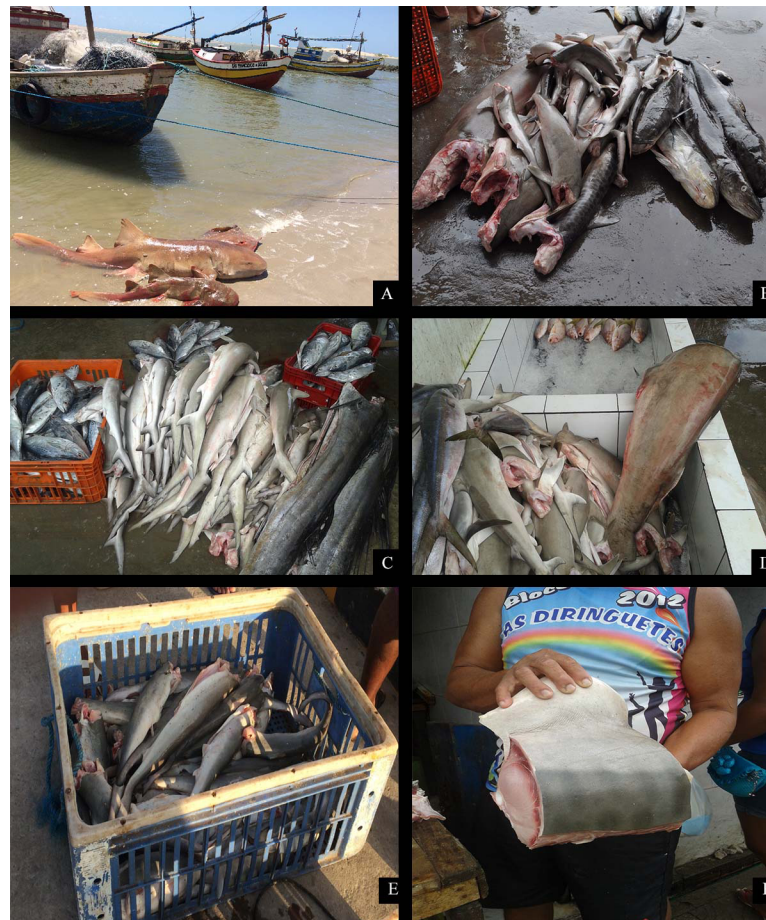
Fig 4. Shark meat trade in Maranhão. (A) Two Ginglymostoma cirratum specimens landed whole; (B), (C), (D) landed carcasses with fins attached; (E) landed carcasses without fins attached; (F) trade of fresh Galeocerdo cuvier meat.

https://doi.org/10.1371/journal.pone.0193969.g004