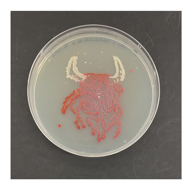
FIGURE 1 Example of agar art produced using Serratia marcescens (areas in red) and Micrococcus luteus . Images were repeated in triplicate

An example of the images obtained is shown in Figure 1, with an example of a plate where Ser. marcescens and M. luteus were used to create the image. In the case of the