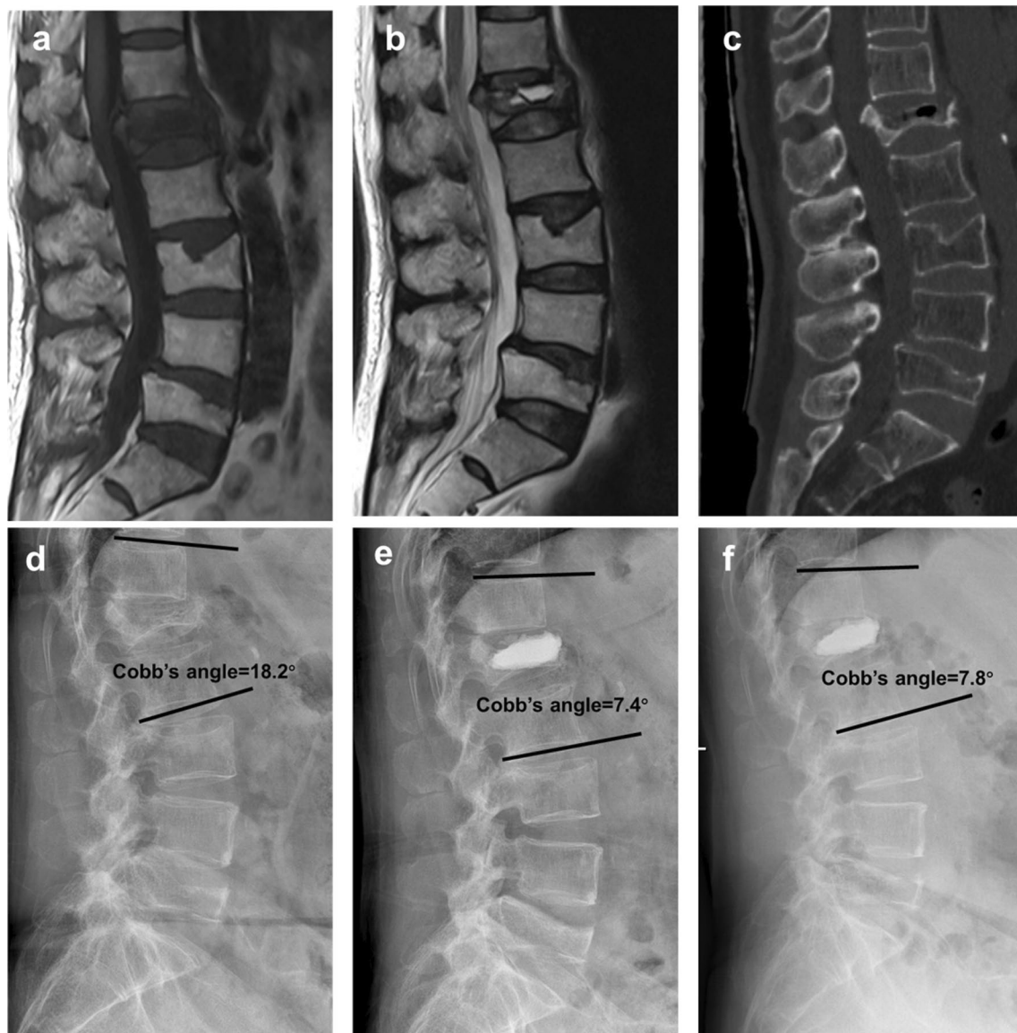
Fig. 2 A 64-year-old woman who had L1 stage III Kummell disease without neurological symptom was treated with PKP. a–c The preoperative MRI T1WI, MRI T2WI and CT films showed a chronic osteoporotic vertebral compressive fracture. d–f The preoperative, postoperative and final follow-up X-ray films displayed the vertebral height and Cobb's angle was well recovered

hyperextension kyphosis with the help of an expanded balloon. In a word, both PKP and PVP can effectively treat stage III Kummell disease and PKP can achieve better vertebral height restoration and kyphosis correction than PVP.