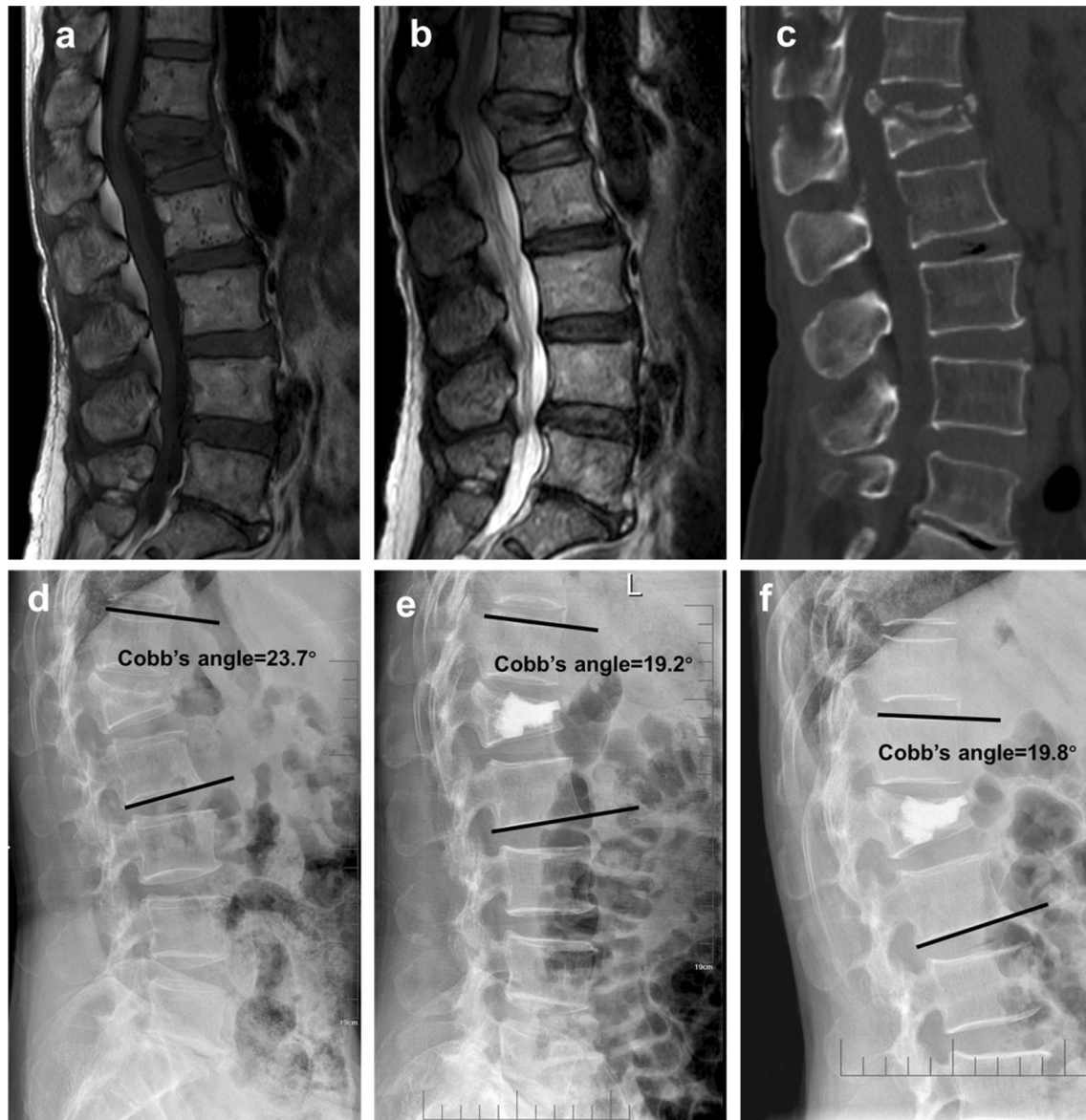
Fig. 3 A 63-year-old woman who had L1 stage III Kummell disease without neurological symptom was treated with PVP. a–c The preoperative MRI T1WI, MRI T2WI and CT films showed a chronic osteoporotic vertebral compressive fracture. d–f The preoperative, postoperative and final follow-up X-ray films displayed the vertebral height and Cobb's angle was recovered a little

anti-osteoporosis treatment, but also related to the small sample size. To sum up, PKP and PVP are both effective quality methods, but PKP is superior in terms of cement leakage.