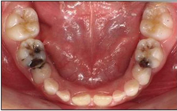
Fig. 1 Severe decay of the first and second mandibular primary molars, intraoral arch length decreased

food preference and dietary intake, relating to developmental delays. 20 Evidence also demonstrates a possible relationship between caries and body mass index. 21,22 So it is of great value for pediatric dentists to prevent and treat dental caries properly and optimal restoration of the morphology and function of primary teeth is in need to maintain and improve the oral health condition of young children in clinical practice.