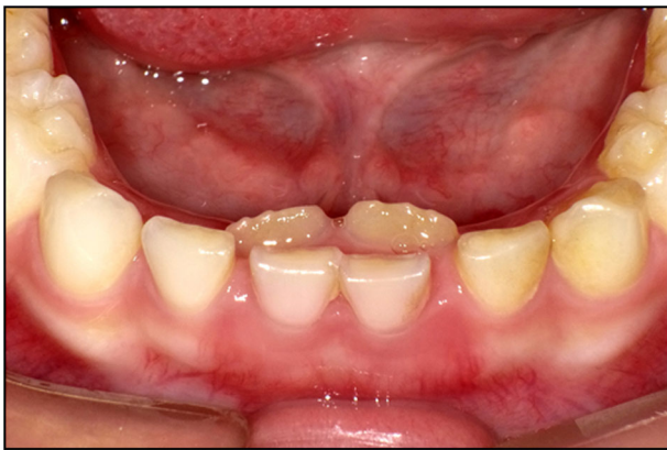
Fig. 6 Retention of mandibular primary incisor caused ectopic lingual eruption of mandibular permanent incisor