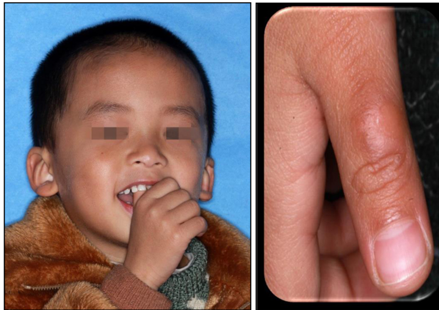
Fig. 8 Thumb sucking and deformation of the thumb