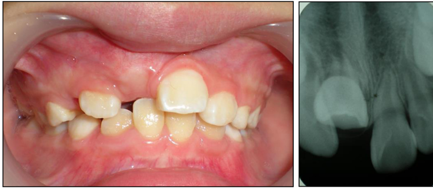
Fig. 3 Impaction of maxillary right central incisor (left), X ray film shows the dilacerated tooth (right)