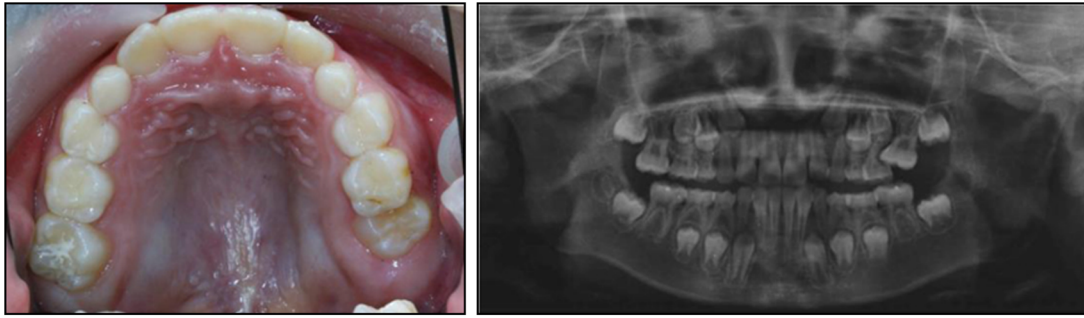
Fig. 5 Ectopic eruption of the maxillary left first permanent molar, loss of the upper left second primary molar; Left, intraoral photograph; Right, Radiographic illustration