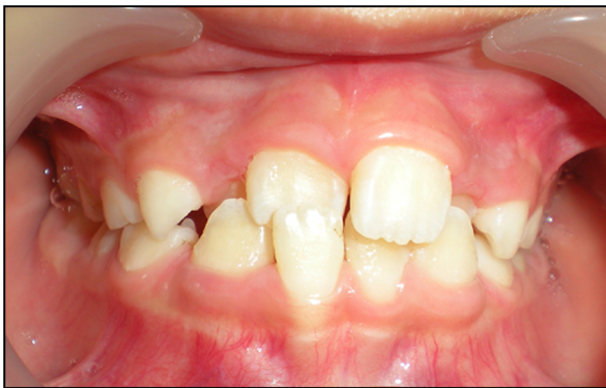
Fig. 7 Delayed exfoliation of maxillary right primary incisor caused ectopic palatal eruption of maxillary right incisor, crossbite formed

and biting. A lip bumper appliance can be used to break this bad habit. 53