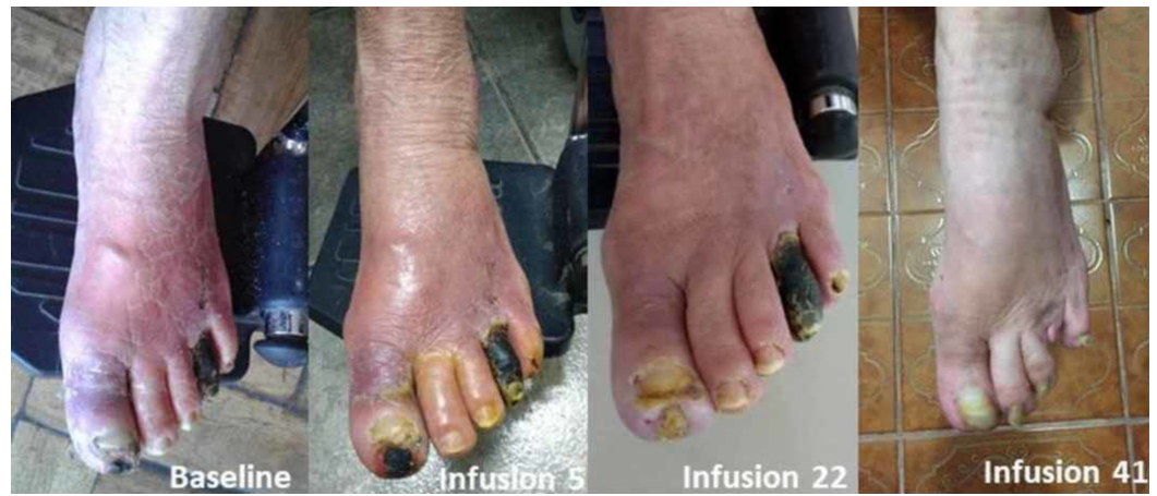
FIGURE 1: Evolution of dry gangrene

Initial presentation and evolution of dry gangrene during treatment with edetate disodium-based infusions.