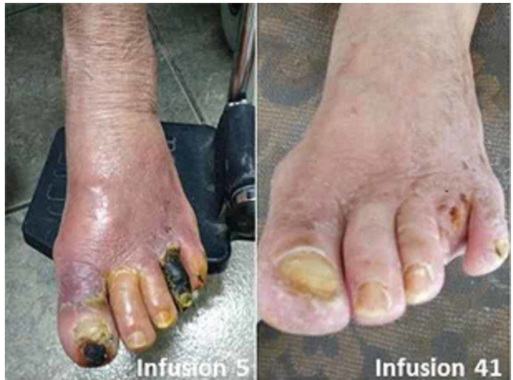
FIGURE 3: Wound healing of dry gangrene of left hallux

Because of marked improvement the patient elected to continue maintenance infusions twice per month for 10 additional infusions totaling 50. Although there was no instrument-based measure of quality of life, the patient, upon completion of 47 infusions, 337 days after first presentation for amputation, was pain free, and expressed, “I have my feet again.” There were no treatment-related adverse events. Her serum creatinine at infusion 40 was 0.62 mg/dL with an estimated GFR of 97.9 mL/min per 1.73 m 2 . A urinary tract infection developed which resolved with antibiotic treatment between days 112 and 116. There were otherwise no changes made to baseline medications. The 4th toe painlessly auto amputated after the 40th infusion (Figure 1). Using the same technique and operator compared with baseline, arterial duplex studies performed at infusion 43 demonstrated improved flow in the left AT and PT.