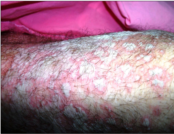
Fig. 1. Revealed numerous pustules on erythematous areas that tended to unite and did not display a follicular localization on the legs.