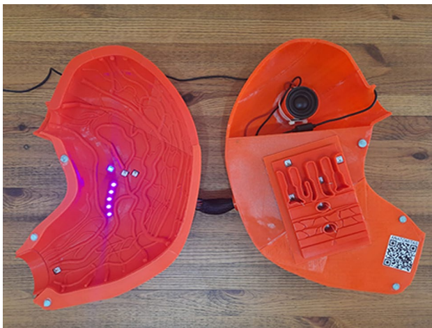
Fig. 2 Patent hardware part

Both the outer surface and one half of the inner surface of the smart model, which is attached to each other with a hinge and can be opened and closed in twofold, have the appearance that reflects the macroscopic (anatomical) feature of the relevant organ or tissue. The other half of the inner surface of the same model has an appearance that reflects the microscopic (histological) feature of the relevant organ or tissue. The histological surface will be placed on the model by enlarging the microscopic image of the section of the tissue or organ it belongs to. There are touch sensors on the places corresponding to each formation on the smart model, and when these are pressed, audible information about that formation is given. Since the borders of the pressed area are shown on the model with light, the student can better understand which area they are working on (Fig. 2). In addition, when the name of any of the formations is spoken, this spoken word is detected by the microphone embedded in the system, and audio information about it is given through the built-in speaker. Thus, both macroscopic and microscopic visual education is integrated with theoretical information on the same model, and interactive education is provided.