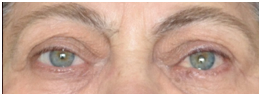
Figure 5 The patient's appearance 16 months after bony orbital decompression and strabismus surgery. Orthotropy in primary gaze position.

and no signs of exposure keratopathy or optic neuropathy. On replacement therapy with levothyroxine sodium 125 µg, the patient maintained stable euthyroidism.