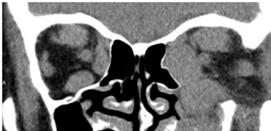
Figure 3 Multislice scan (coronal plane) 1 week after bony decompression of the left orbit.

During a 2-year follow-up after the surgery, there were no new episodes of reactivation of the orbital inflammation,