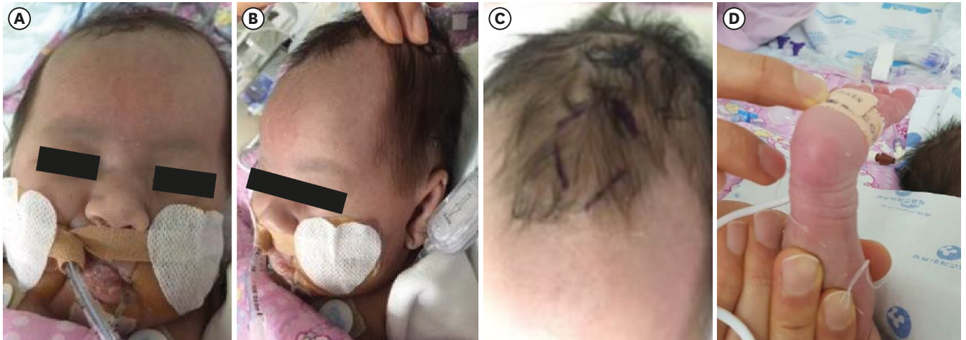
Fig. 1. Clinical photographs of patient. Patient showed (A) typical box-shaped face, (B) large fontanelle, (C) midfacial hypoplasia, and (D) club foot. The figures are published with agreement of parents.

Intolerant From Tolerant, and MutationTaster and classified as likely pathogenic. Although we could not perform the enzyme analysis for 3-HAD and 2-enoyl-CoA hydratase, we assessed the patient as a type III DBP deficiency through the genotype of HSD17B4 (Fig. 2D).