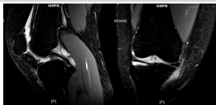
Figure 2: MRI of the right knee (PDW_SPAIR) shows an intra-articular lesion on the right tibiofemoral joint space along with the effusion on the suprapatellar bursa.

Upon examination, an initial inspection of the right knee revealed no deformity in both knees. On palpation, there was a palpable mass on the anteromedial tibial condyle of the right knee, where moderate intra-articular swelling was also present. The mass was roughly 2 by 2 cm in dimension and had a dense and firm consistency. The border was distinct, uniform, and smooth. While palpating the mass, it was immobile and mildly tender. The patient could fully extend her knee, but discomfort prevented her from flexing it deeply. There was no ligamentous instability found. On the magnetic resonance imaging (MRI) examination, an extra-articular multiloculated hypo-intense