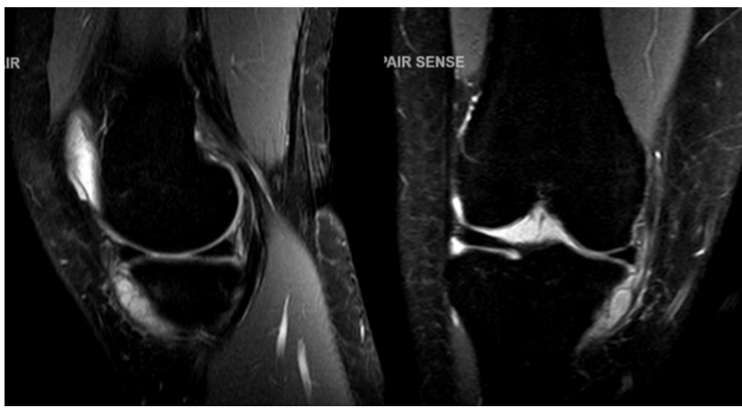
Figure 1: MRI of the right knee (PDW_SPAIR) shows an extra-articular multiloculated hypo-intense cystic lesion on the medial aspect of the tibial condyles.

authorization to disseminate the data included in this report. The patient exhibited 2-month duration of gradually worsening pain in her right knee. The patient experienced increased pain when she engaged in activities such as climbing stairs and exercising, which limited her ability to walk long distances. The patient's medical history did not reveal any notable findings. There was no history of injury to the knee before the patient's symptoms. The patient also complained of a growing mass over the medial aspect of the right knee, which has been noticeable for the past 2 months. The mass formed spontaneously without any prior injury.